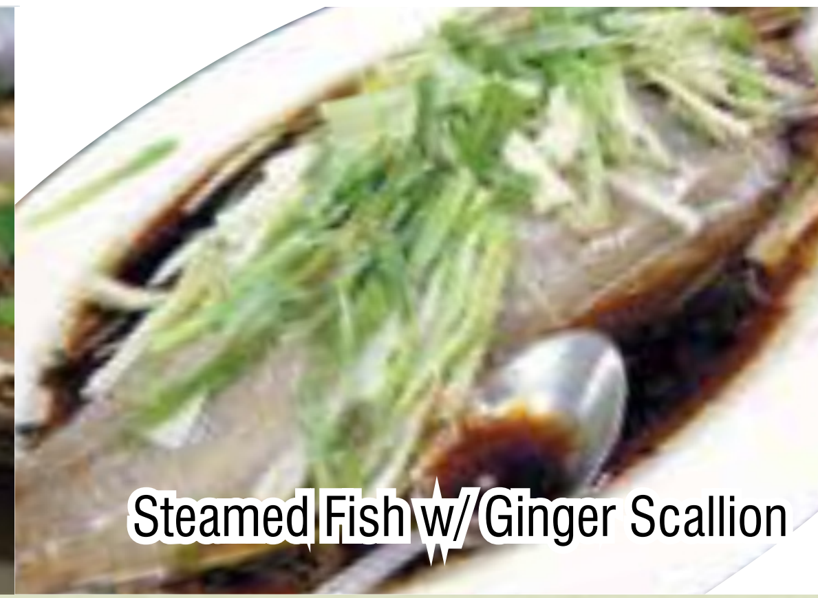
Steamed Fish w/ Ginger Scallion