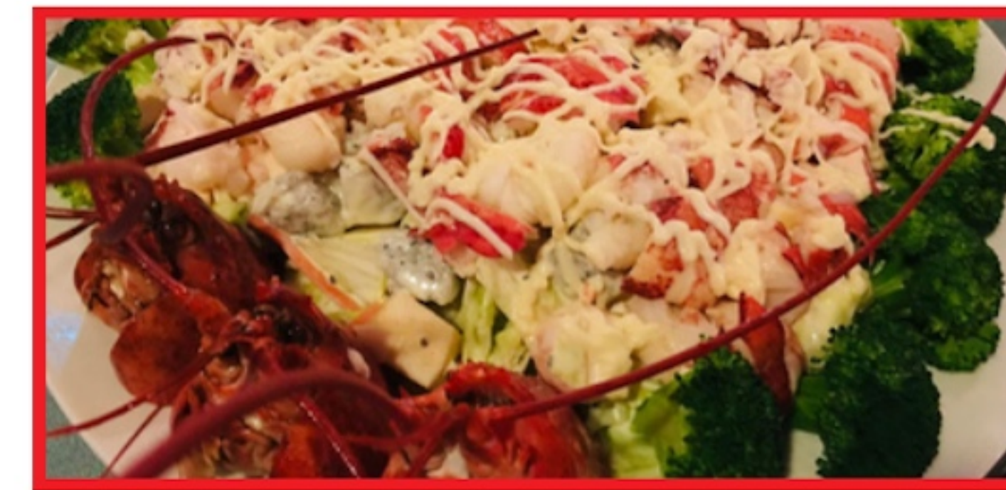
Lobster Salad (Pre-Order Required)