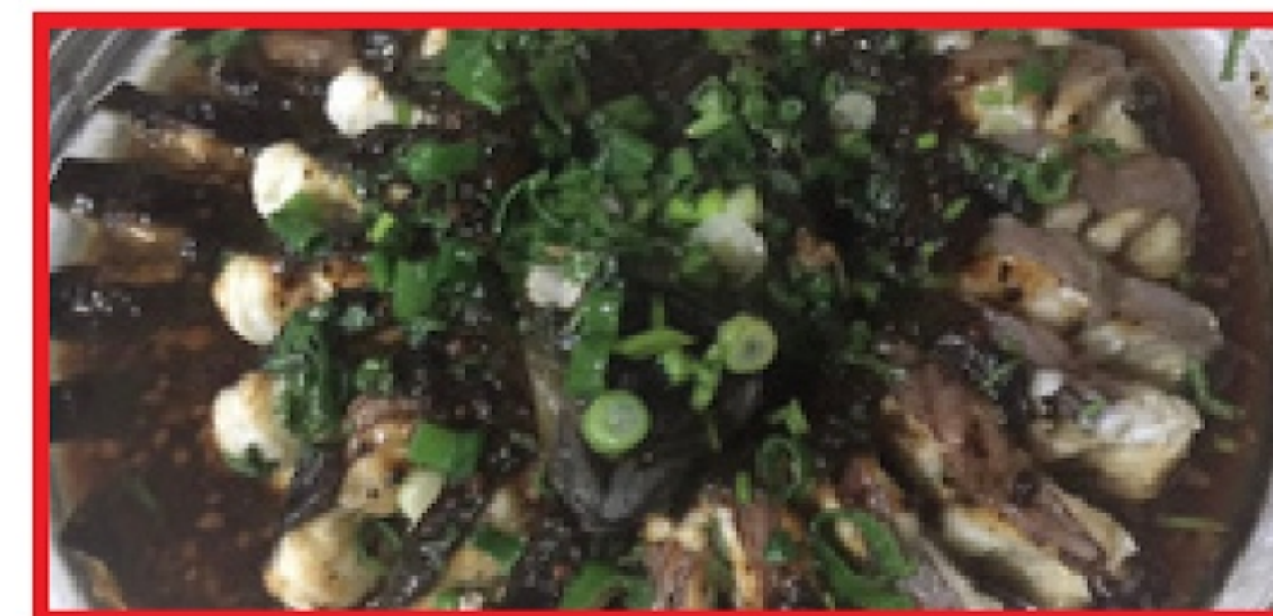
Steamed Eel with Black Bean Sauced