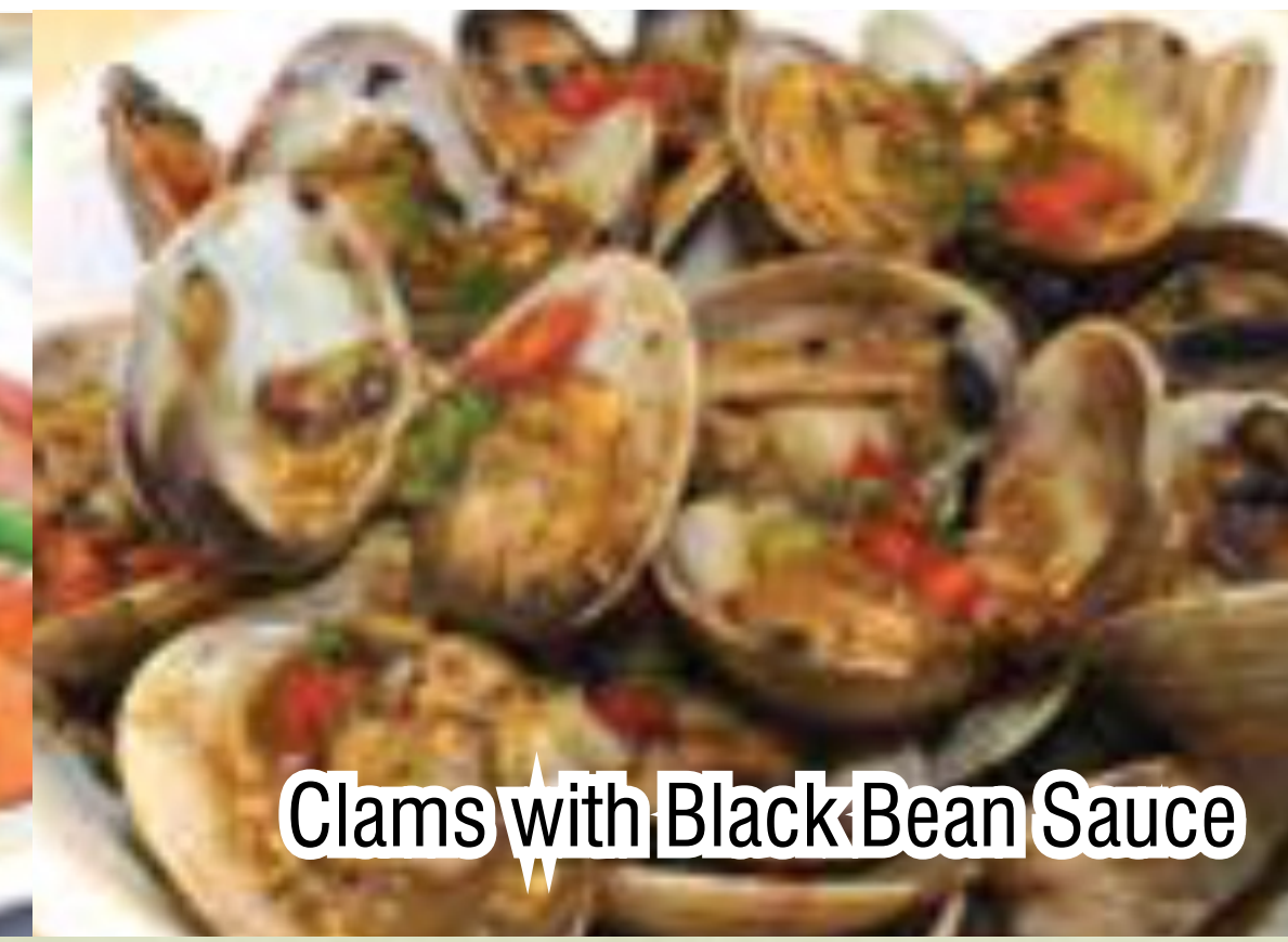
Clams with Black Bean Sauce