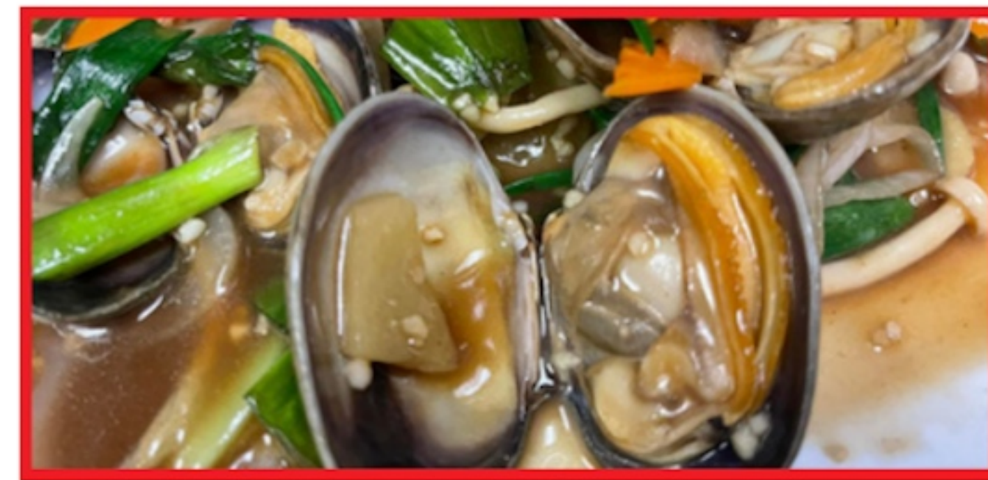
Clam with Ginger Scallion Sauce