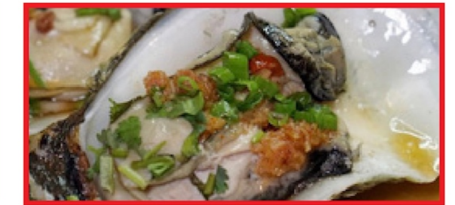
Steamed Oyster with XO Sauce