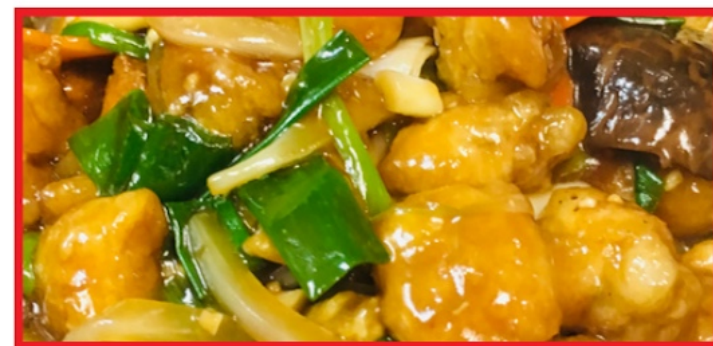
Frog Leg Tofu in Clay Pot