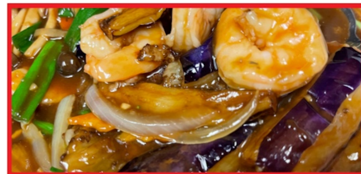
Jumbo Shrimp with Spicy Eggplant