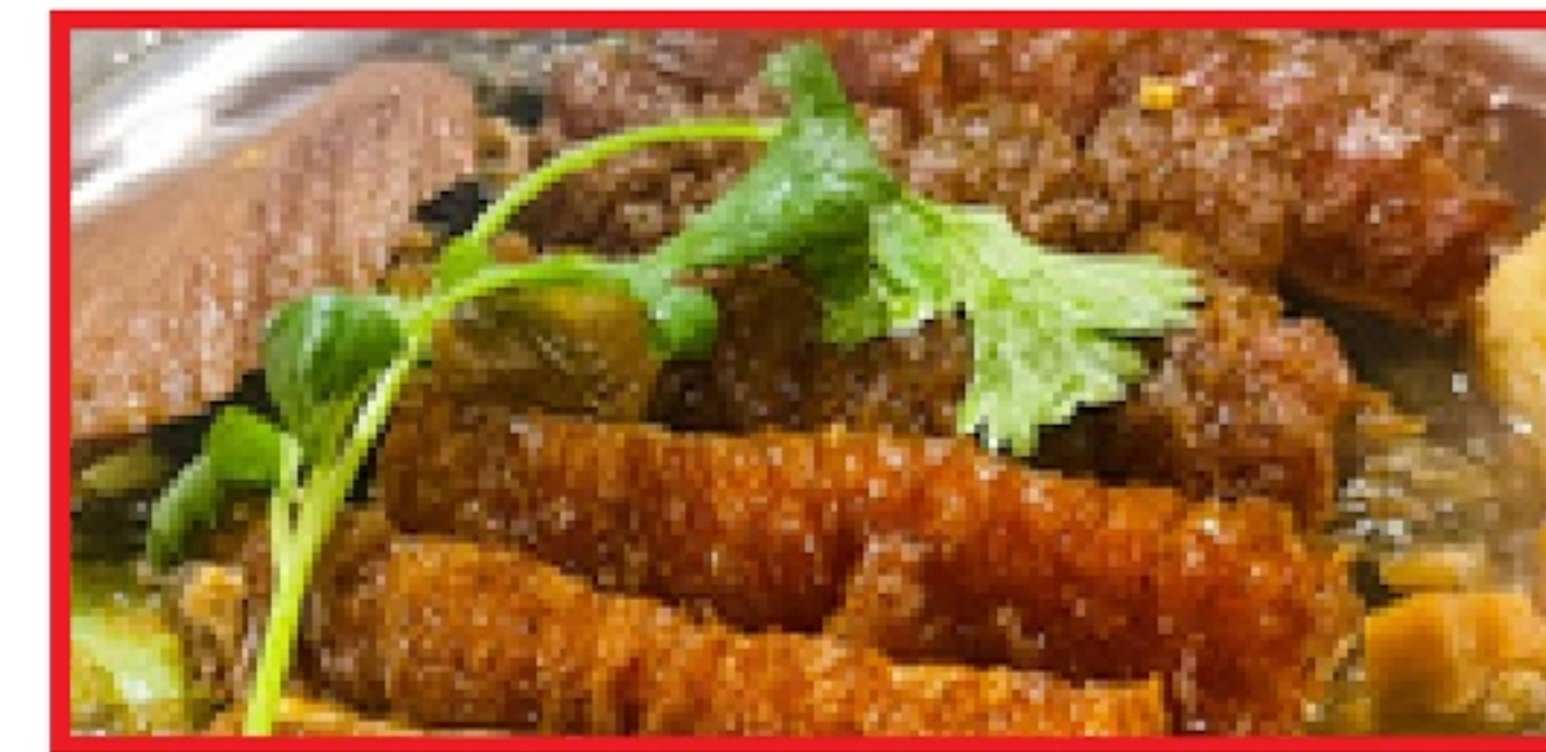
Pork Belly with Preserved Vegetable