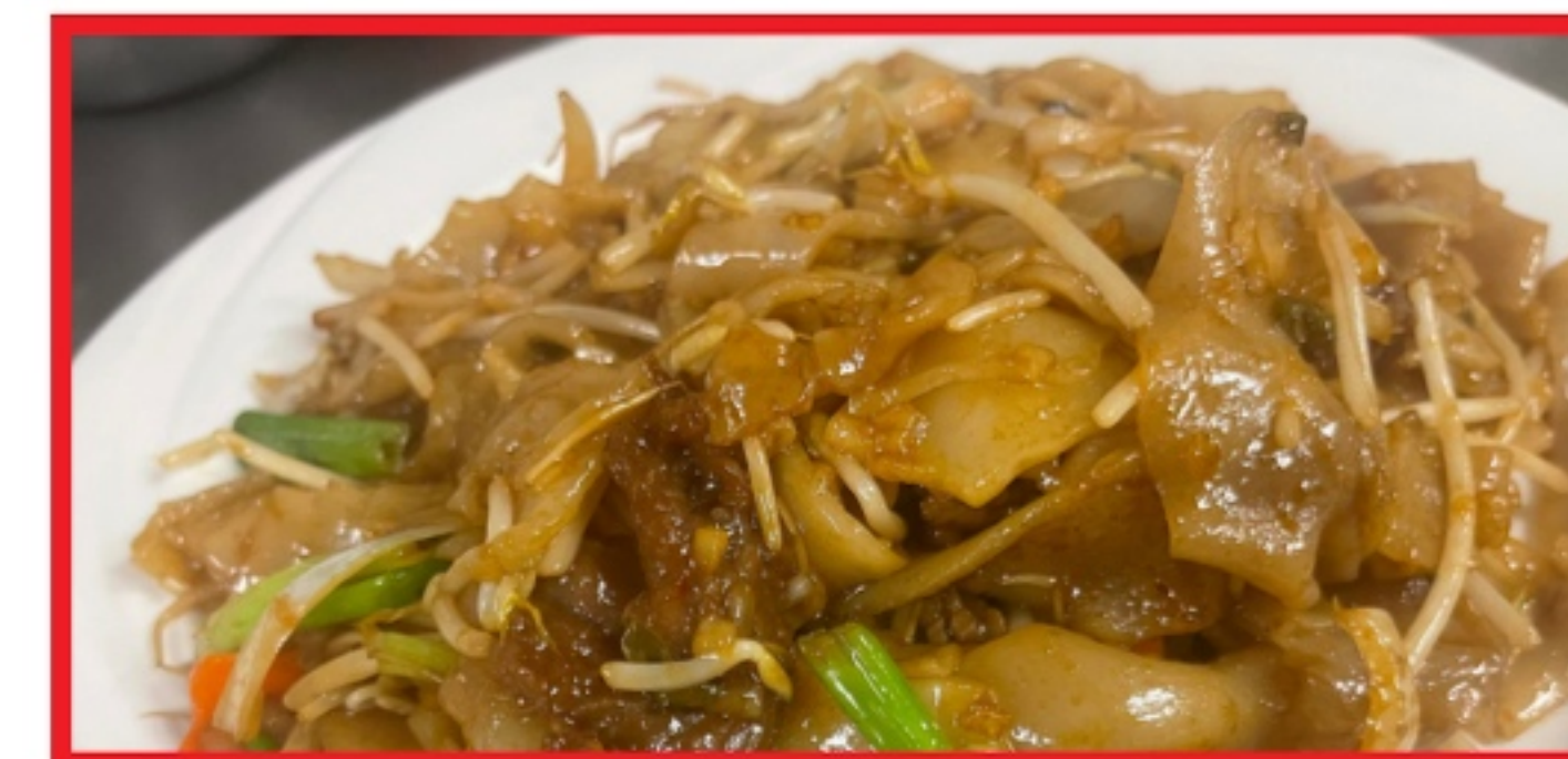
Beef Chow Fun