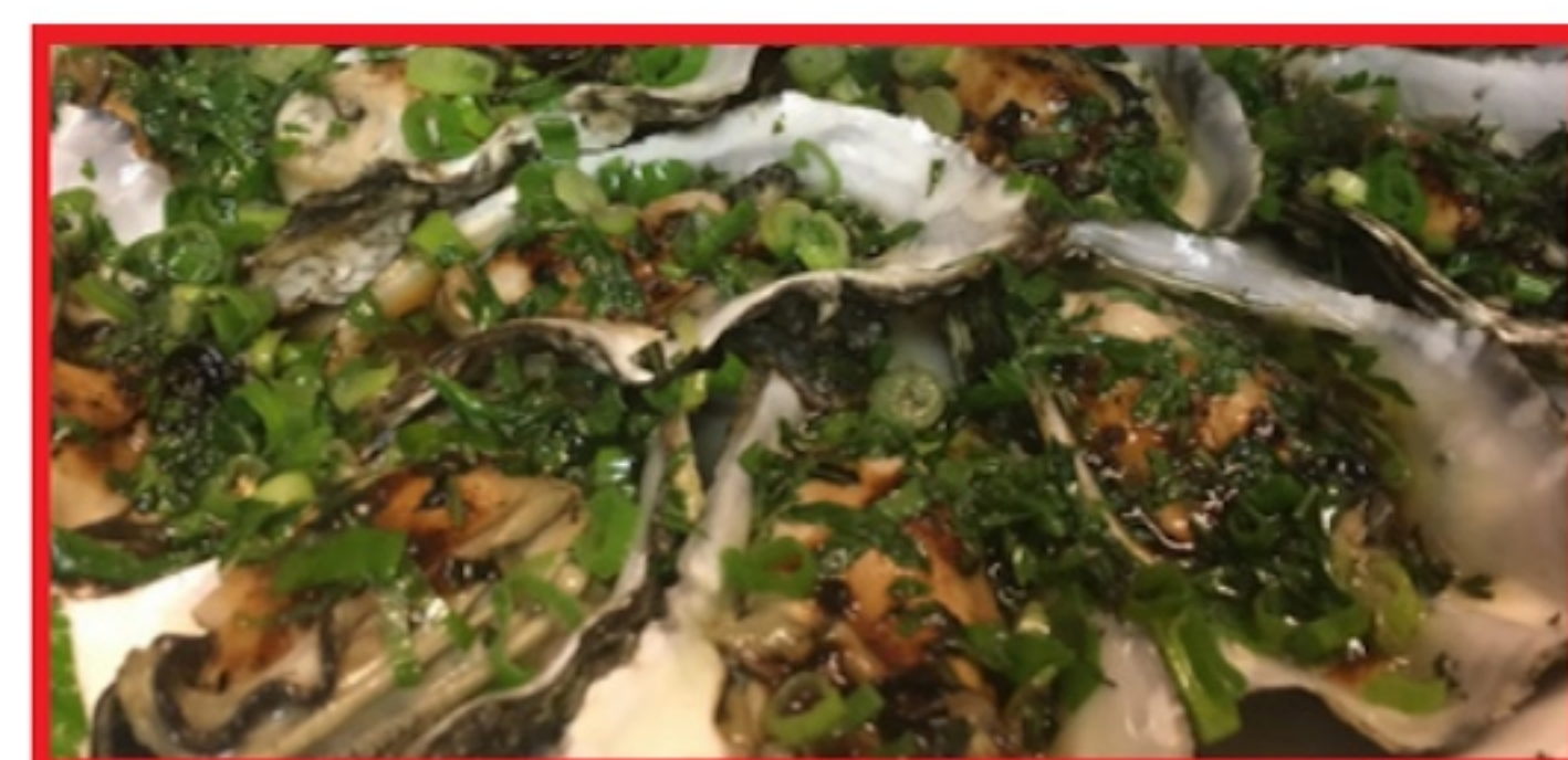
Steamed Oyster in Black Bean Sauce