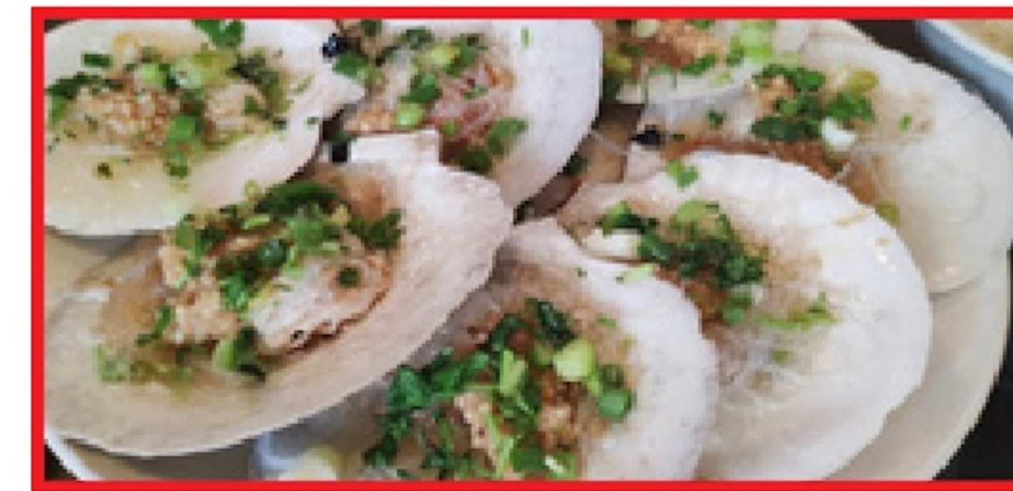
Steamed Scallop with Vermicelli