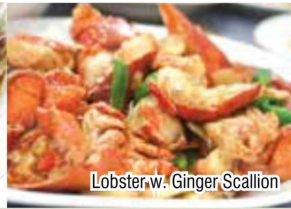
Lobster w. Ginger Scallion