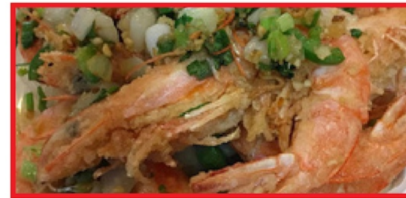
Salt & Pepper Shrimp (Shell On)