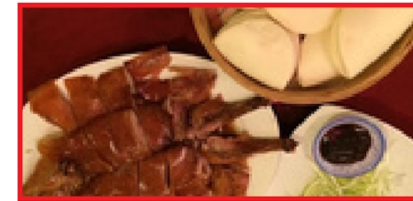
Peking Duck with Bun