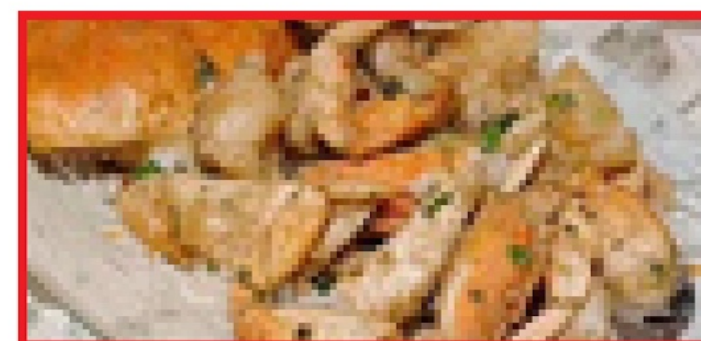
Salt & Pepper Crab