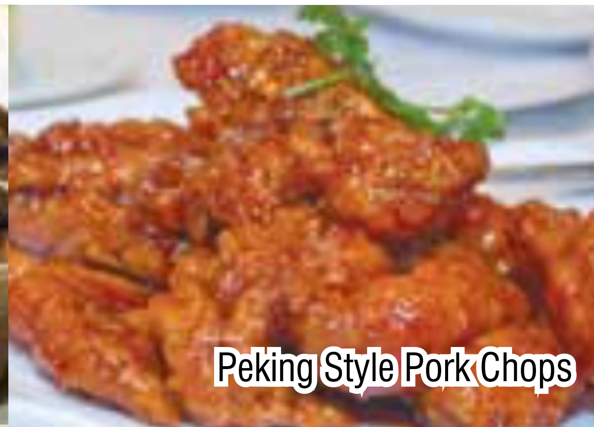
Peking Style Pork Chops