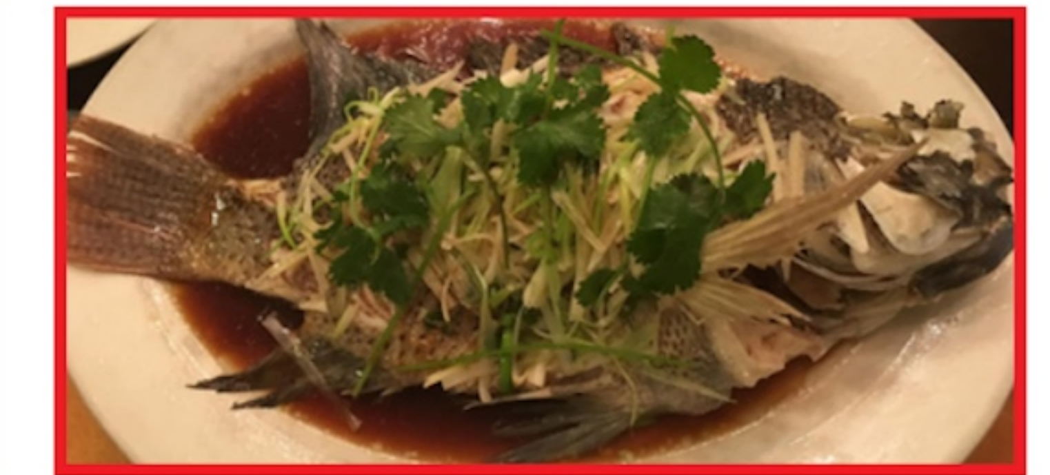
Steamed Fish with Ginger Scallion