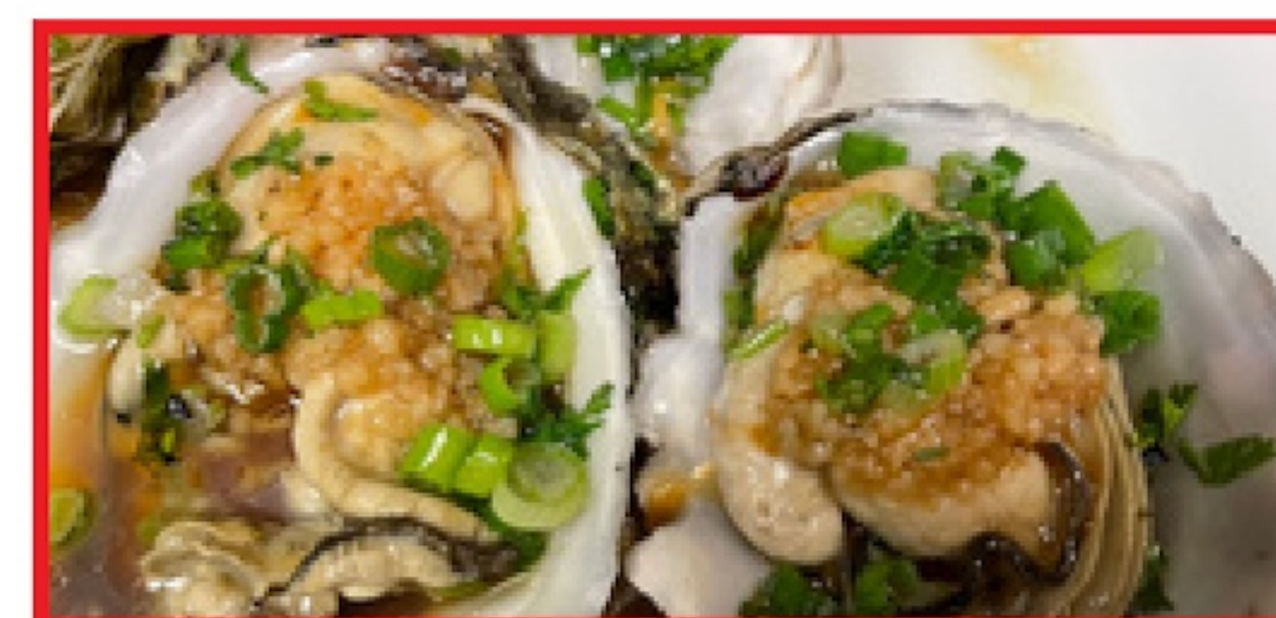
Steamed Oyster with Garlic Sauce