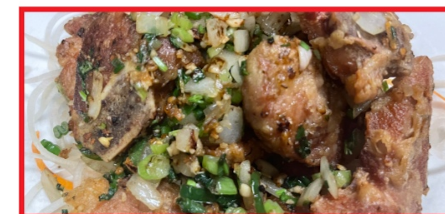
Salt & Pepper Pork Chop