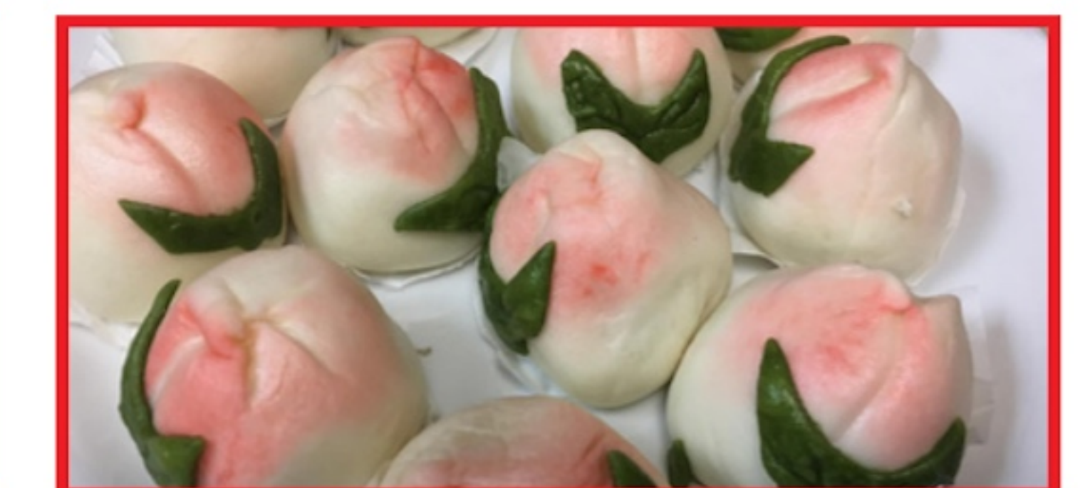
Steamed Birthday Bun