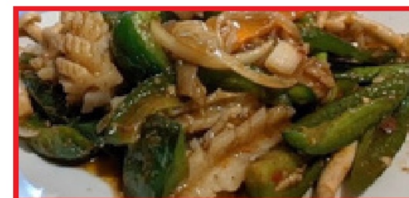
Squid with Spicy Sauce