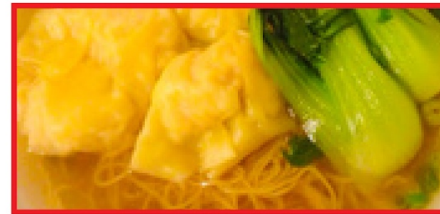
Hong Kong Style Wonton Soup