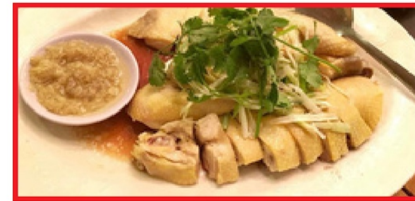
Steamed Free-Range Chicken