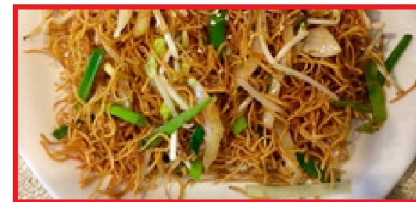
Crispy Noodles in Soy Sauce