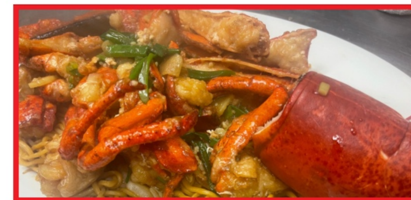
Lobster Lo Mein