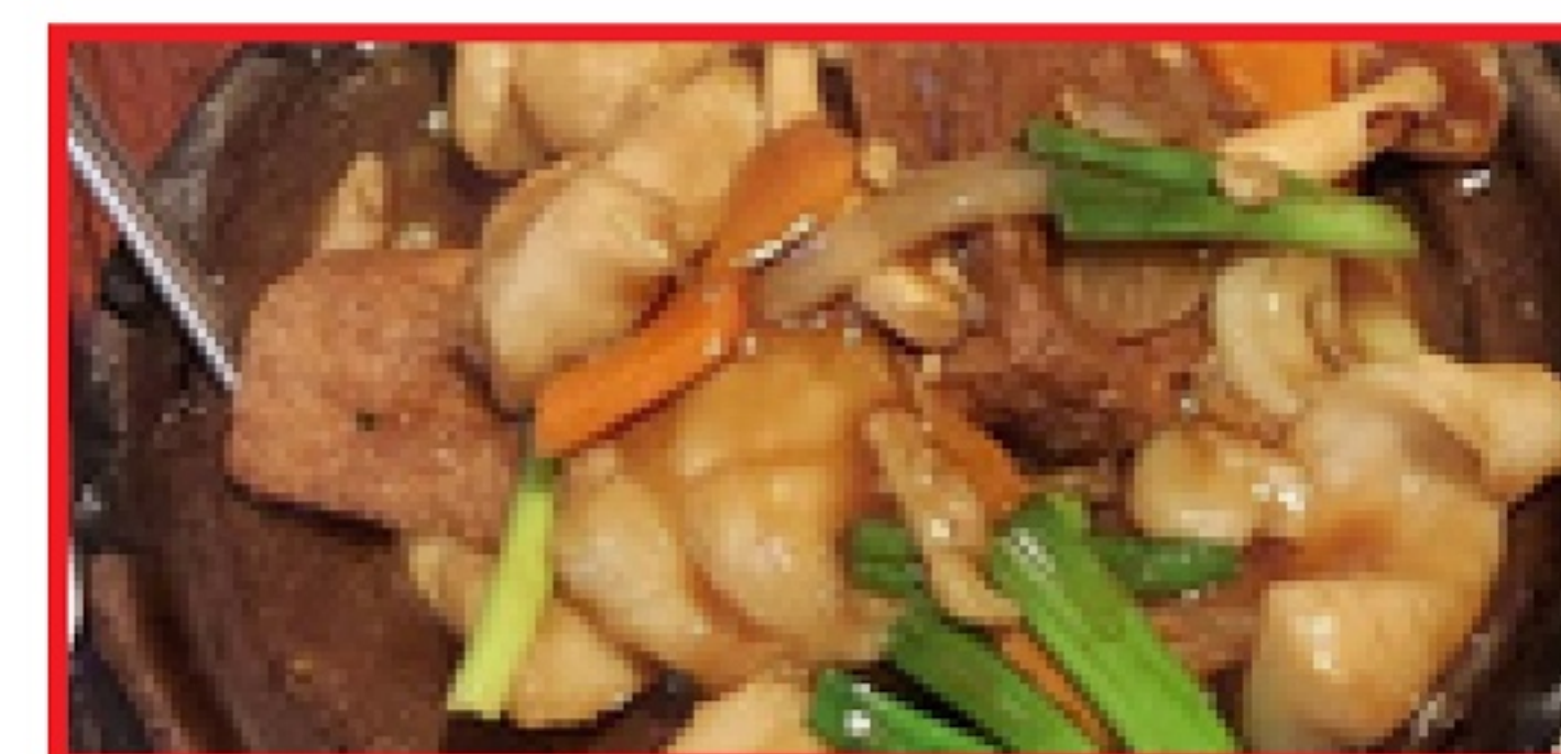
Fillet Tofu in Clay Pot