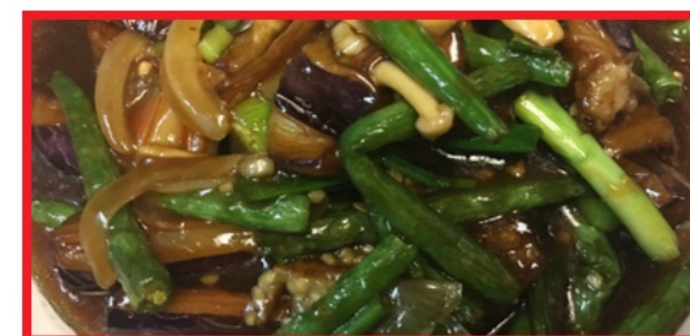
Green Bean in Garlic Sauce