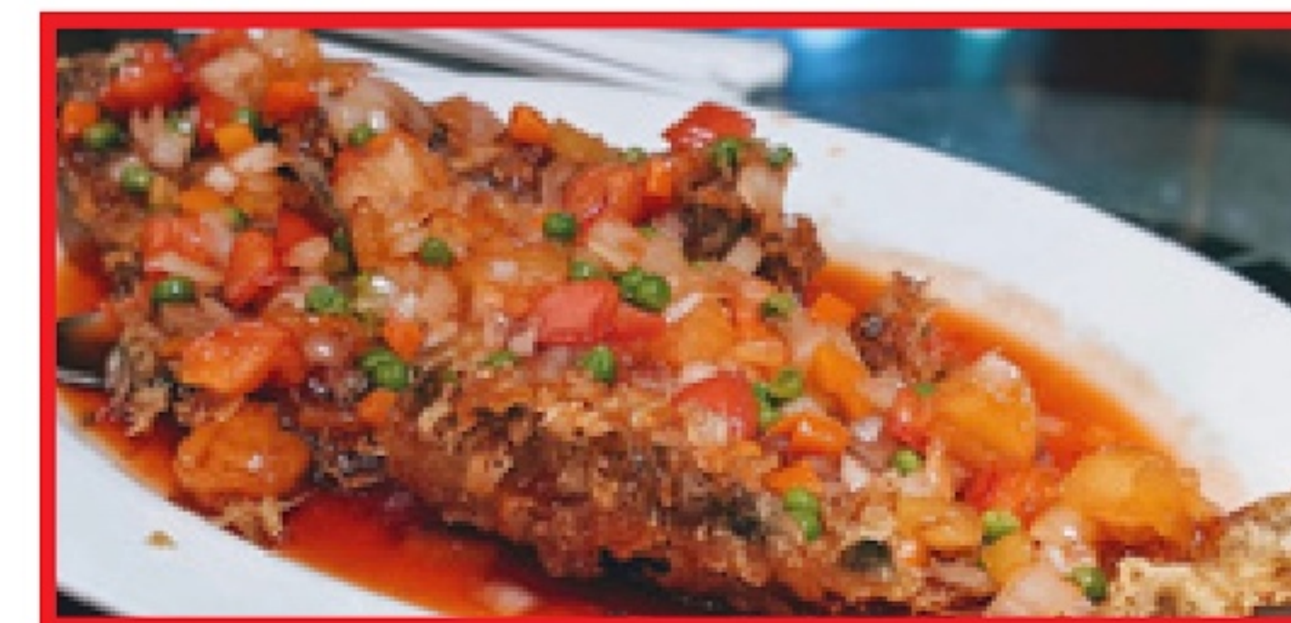
Fried Flounder in Sweet & Sour Sauce