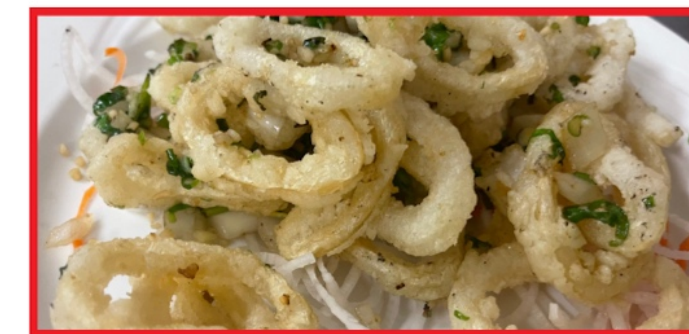
Salt & Pepper Calamari