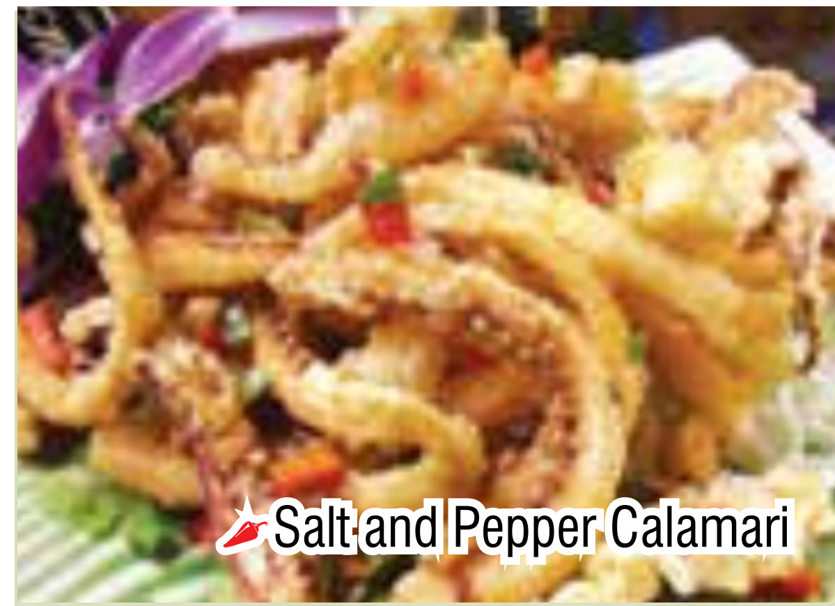
Salt and Pepper Calamari