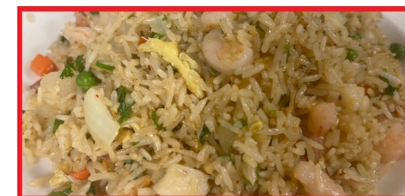
House Fried Rice